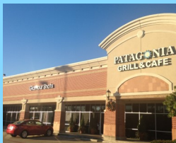
Retail Space Available